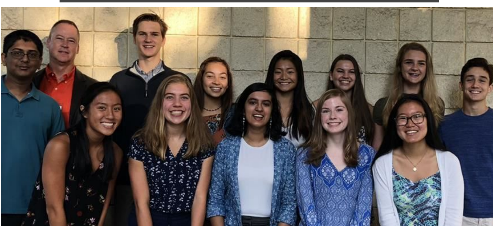
Eastside's 2018-19 National Merit Semifinalists